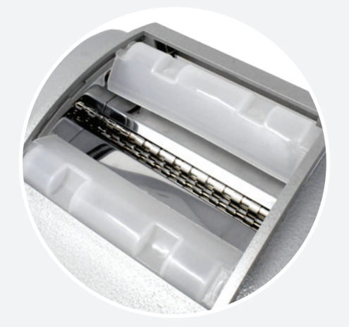
2 Cutters and a Roller